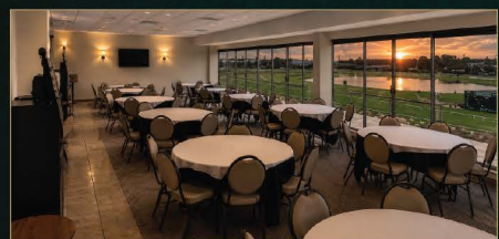
BORK SUITE 338