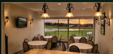
SPACE CITY SUITE 326