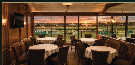
TEXAS CHAMPIONS SUITE 334