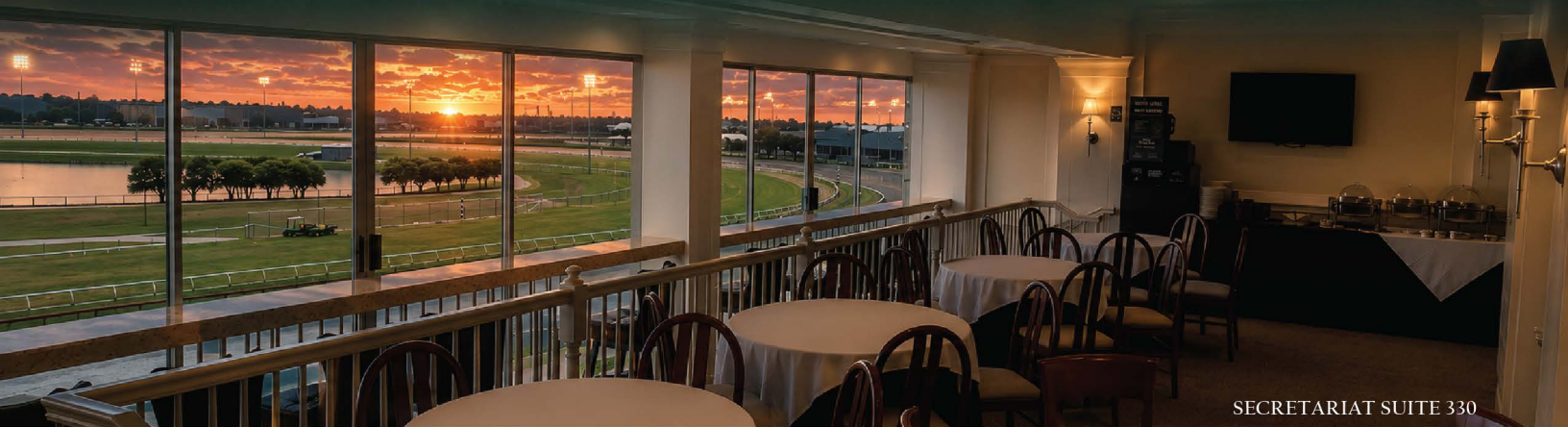
SECRETARIAT SUITE 330